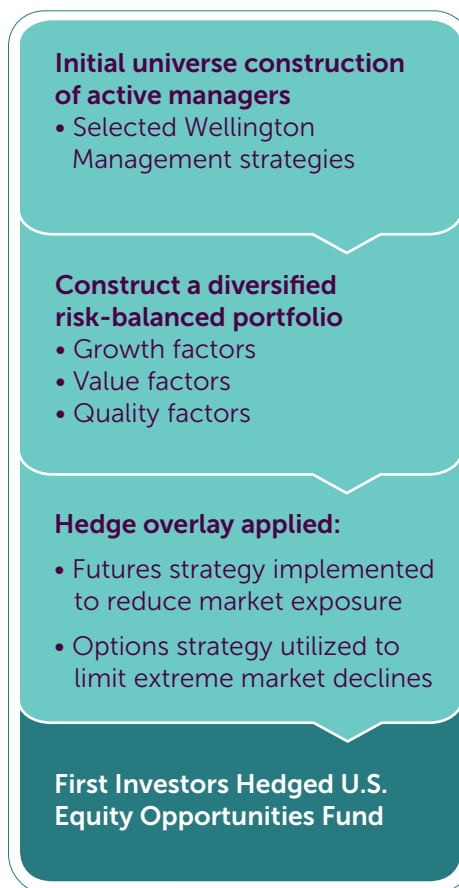
Exhibit 2: Portfolio construction process

Combining the Fund's equity risk-based portfolio with its hedging strategy creates a more complete, diversified risk approach to help protect against the various sources of volatility and mitigate their collective impact on the portfolio, helping to provide a smoother ride for investors.